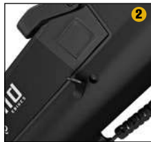
Open the cover