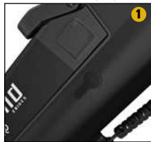
Location of charging